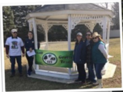
Our Composting Team